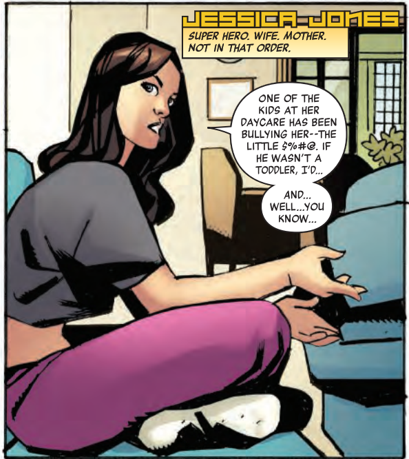
JESSICA JONES SUPER HERO. WIFE. MOTHER. NOT IN THAT ORDER.