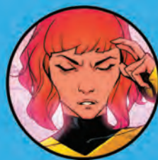
MARVEL GIRL JEAN GREY