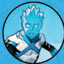
ICEMAN BOBBY DRAKE