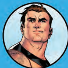
BEAST HANK MCCOY