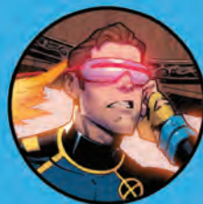
CYCLOPS SCOTT SUMMERS