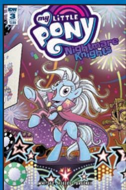
COVER B art by Brenda Hickey