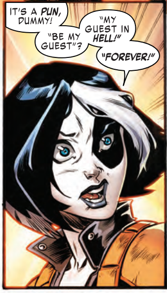
DOMINO A.K.A. NEENA THURMAN.