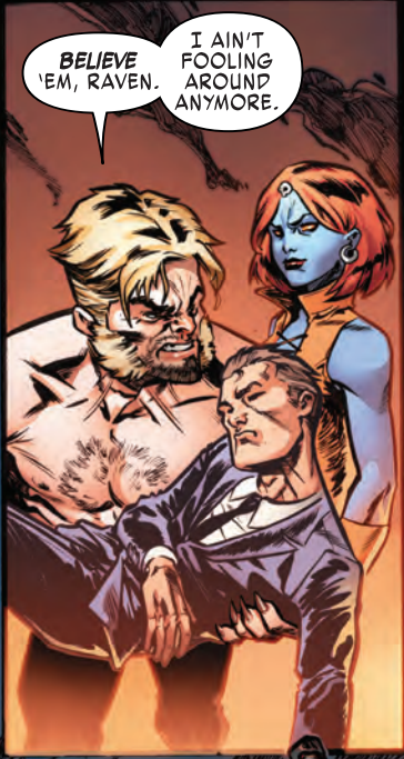
MYSTIQUE A.K.A. RAVEN DARKHOLME.

BELIEVE 'EM, RAVEN. I AIN'T FOOLING AROUND ANYMORE.