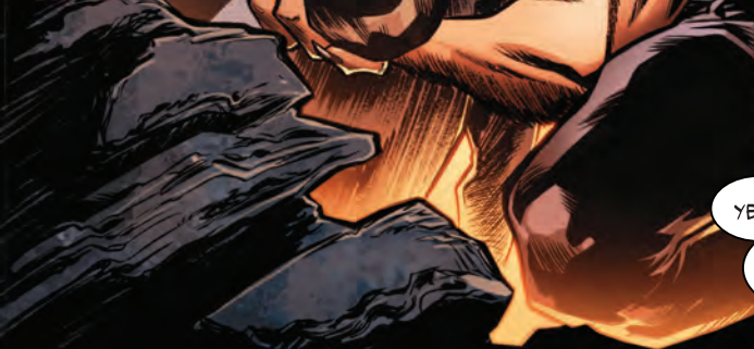
DEADPOOL A.K.A. WADE WILSON.