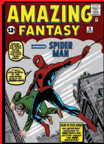
SPIDER-MAN CREATED BY STAN LEE & STEVE DITKO